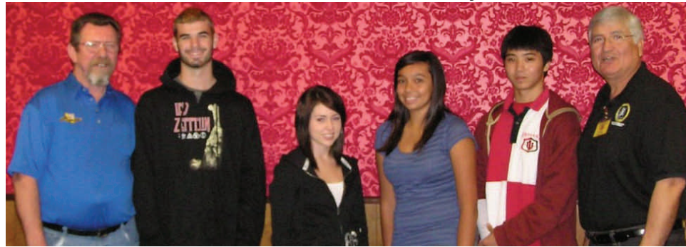
Pictured above are the Monterey Youth Awareness Congress participants of Saturday, November 22, 2008. Three students from Monterey County and one student from Santa Cruz County

CONGRATULATIONS TO ALL PARTICIPATING STUDENTS, GOOD LUCK!