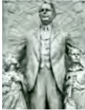
“No Man Stands So Tall And Straight As When He Stoops To Lift Up A Child”