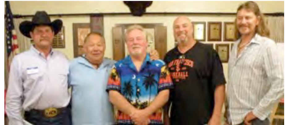
545 Enrollment Ceremony of June 21, 2013