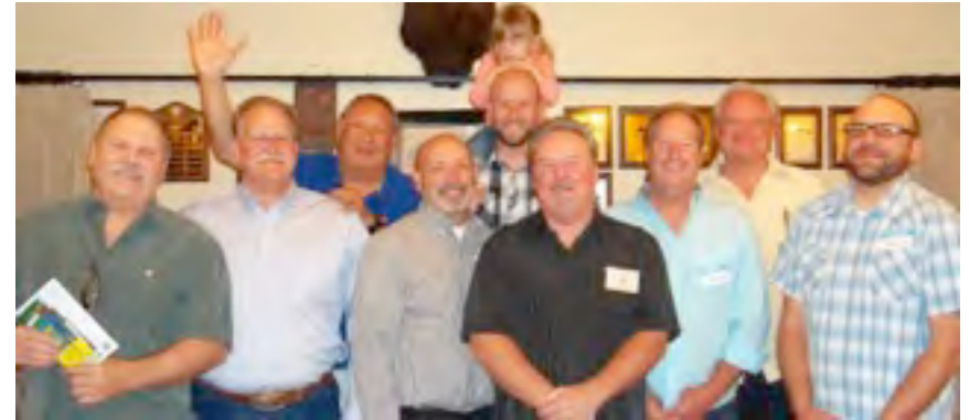
545 Enrollment Ceremony of May 17, 2013