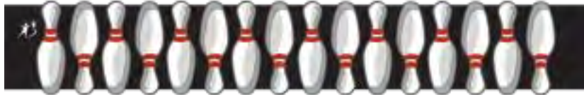
Big Brothers Big Sisters of Santa Cruz County 2013