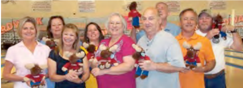
30 th Bowl for Kids' Sake