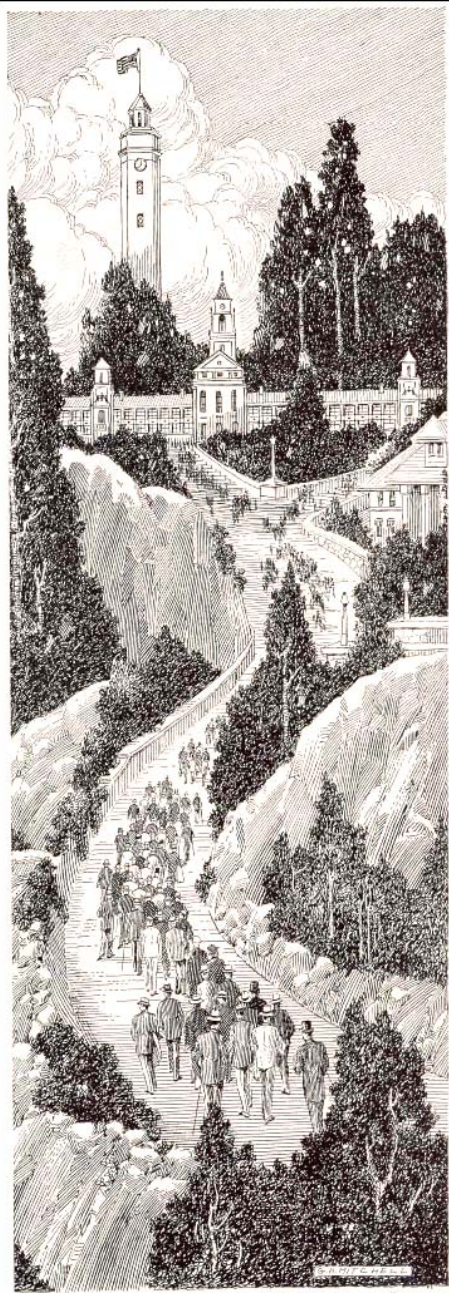
All Roads lead to Mooseheart on Mooseheart Founder's Day. This beautifully idealized image of Mooseheart was created in 1930 and used in the Mooseheart Annual.

545 Board of Officers, Chairs and Volunteers thanks all these members who supported our fundraising efforts in rebuilding our Front Deck and Ramp!! You're the best!! Thank You