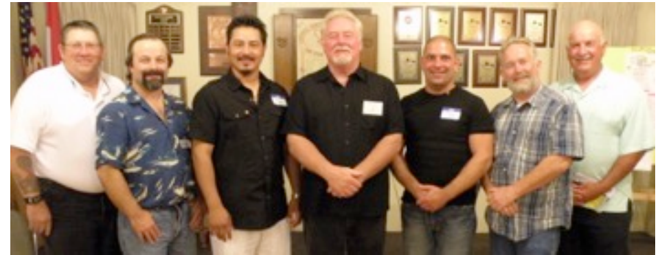
545 Enrollment Ceremony of July 19, 2013