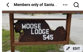
Members only of Santa Cruz Moose Lodge 545