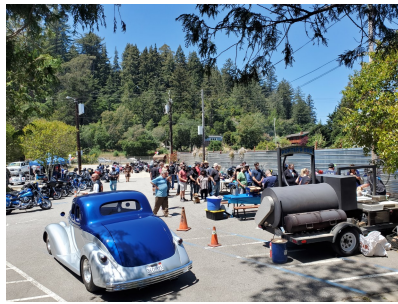
Sunday, May 2nd: Autism Family Network Poker Run fundraising event.