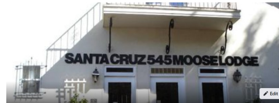
Members only of Santa Cruz Moose Lodge 545