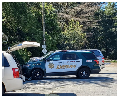
April 27th K-9 Training Session